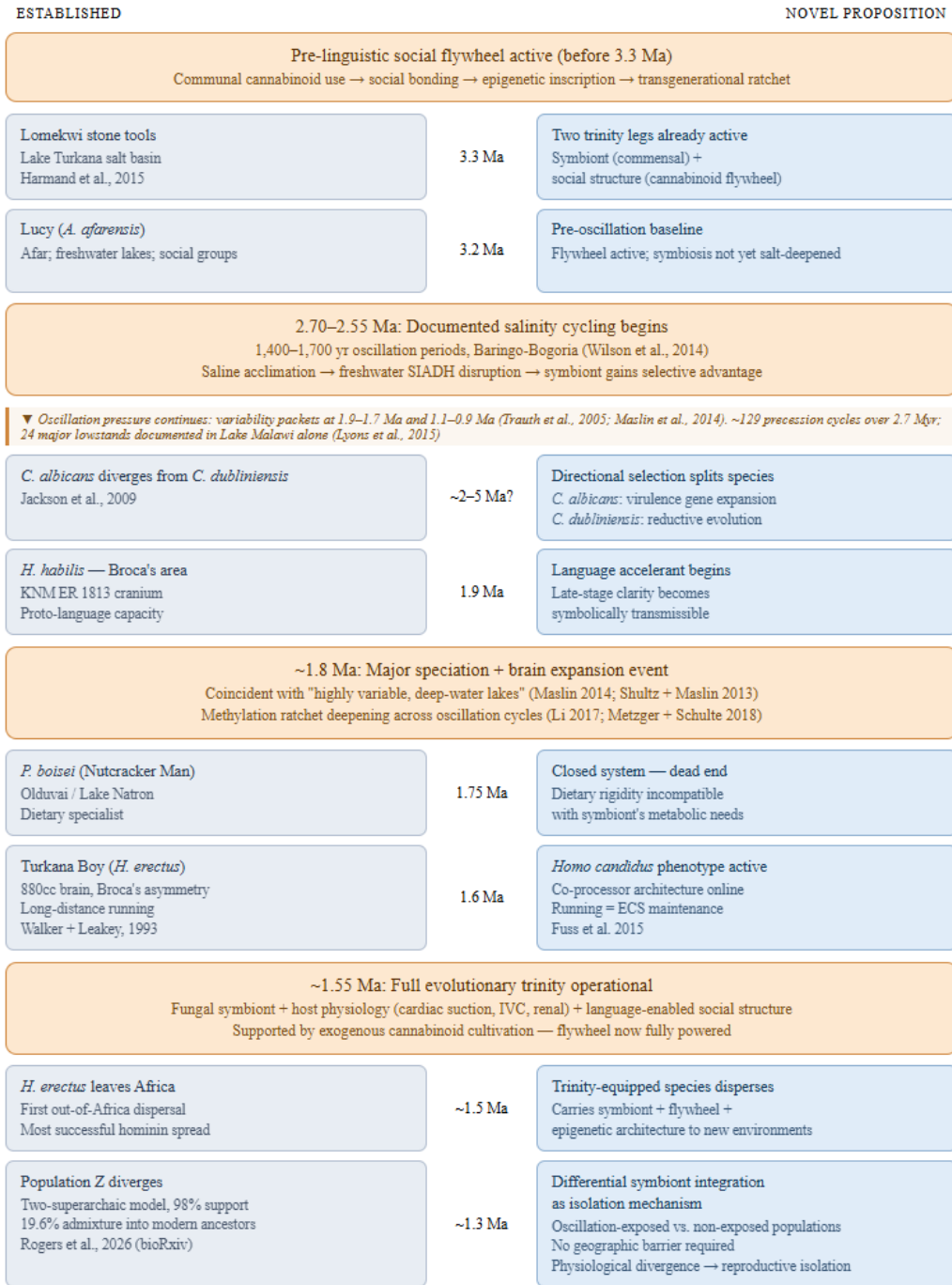
Figure 2 The Critical Window (3.3-1.3 Ma) Convergence of environmental, biological, and coevolutionary evidence